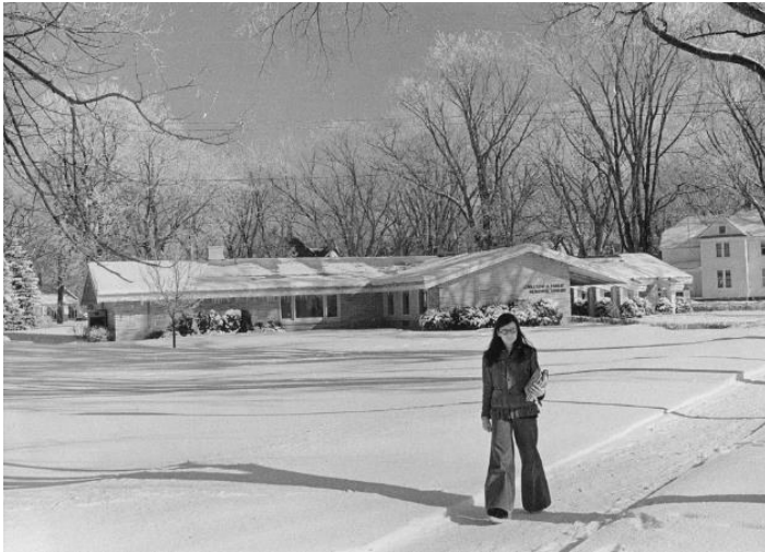
Service Population: 4,500