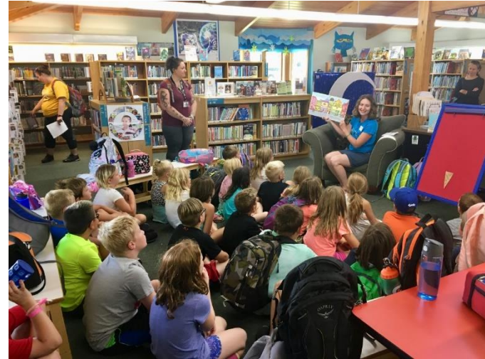
Service Population: 22,000